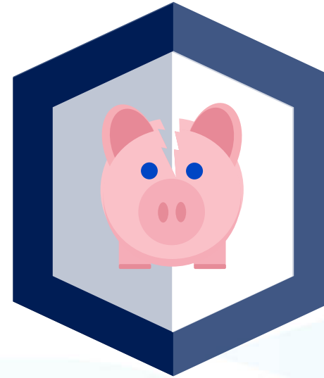
CREDIT REPORT COUNSELING